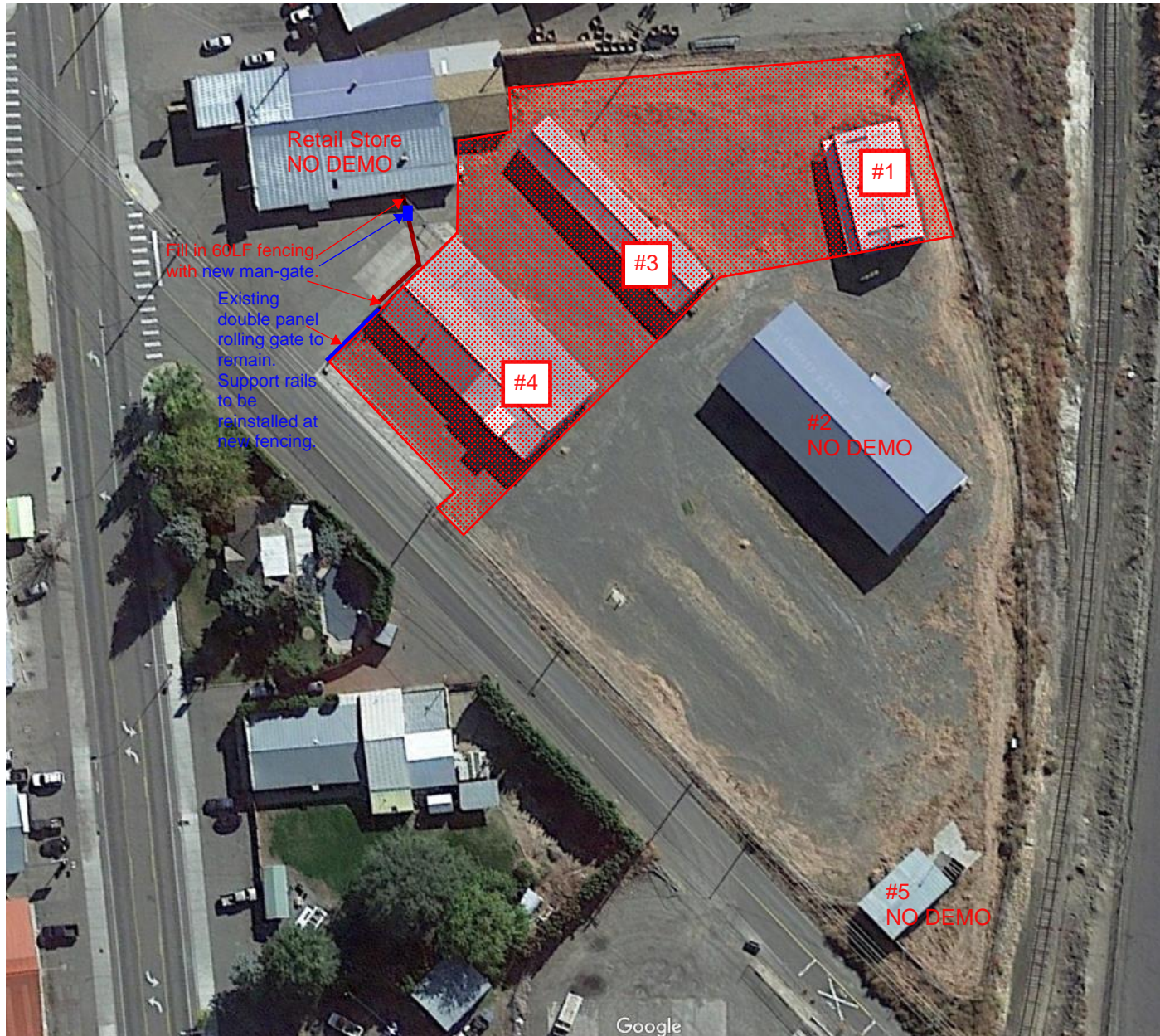
Exhibit A - New Storage Property Demo

1. Demolish and haul off wood frame structures 1, 3 & 4, concrete slabs to remain.